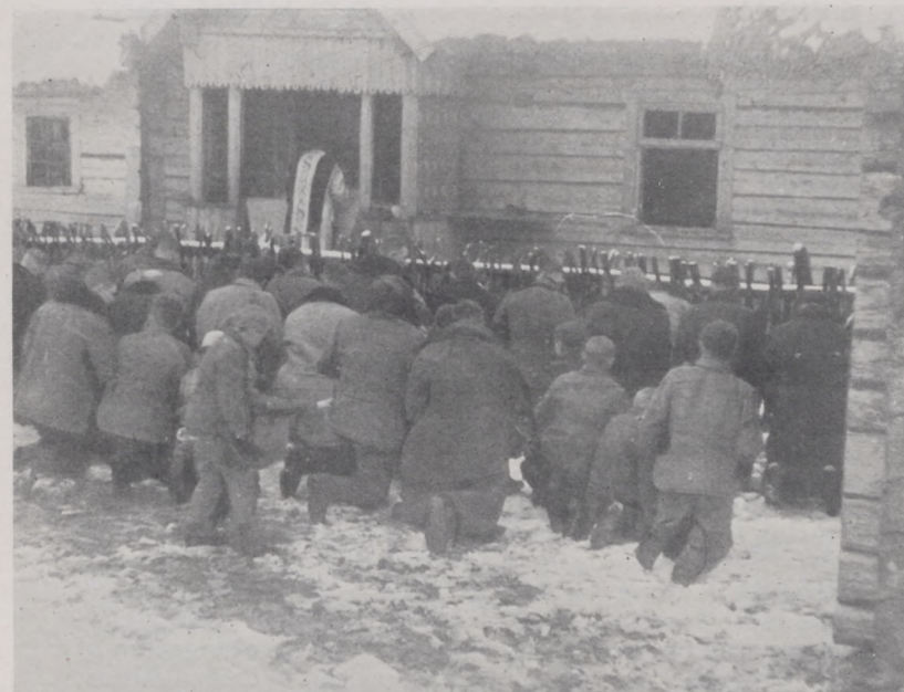
Soldiers of the Polish Underground Army kneeling in prayer before going into battle

where we have already captured WILSON Square and some of the adjoining streets. In some areas the enemy is taking the initiative attempting to force a passage through the main roads leading East-West. The fighting is being prolonged, and captured ammunition does not cover our needs. Lack of assistance from outside can shortly put us in a critical position, especially as the enemy is using ruthless methods setting whole districts on fire and pouring into the battle more and more heavy equipment. The sentiments of the population are turning against Great Britain. . . .