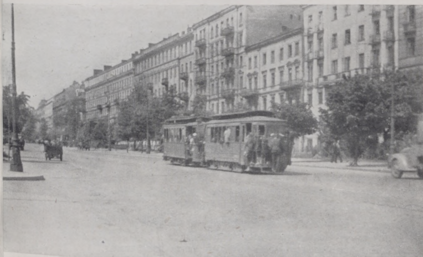
Aleje Jerozolimskie, one of the main streets in Warsaw, on the eve of the insurrection. The trams are the only means of communication left in the City

"Small quantities have reached Warsaw but they have been insufficient to tip the fighting balance in favour of the Poles."