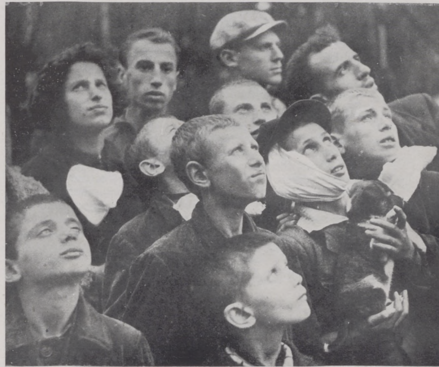
CHILDREN UNDER FIRE

So great was the concentration of artillery fire that in the centre of the city it took about half an hour to get across a space of 300 yards.