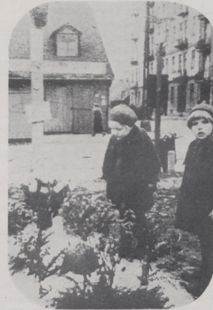
THE SIEGE OF WARSAW WAS OVER

The Polish Home Army in the region contiguous to the capital received the order: "To Arms!" The agreed sign was the one word Burza (Storm). The task of the insurgents was to clear the region of German forces, in order thus to facilitate the progress of the Red Army. At the moment when the insurrection broke out there was nothing which could be interpreted as a thoughtless act of despair, or of ill-considered, ostentatious display of heroism. The leader of the Home Army was faced with the alternative, either of watching the German-Soviet conflict without intervening, or of starting the insurrection, and thus, in view of the extraordinarily difficult political situation of Poland, giving clear proof, not only of its goodwill towards Russia, but also of its determination that Polish soil should be recovered by the arms of Polish soldiers. Vilno, Lwow, Pinsk, Lublin, Kowel and other towns were recovered by insurgents. It was therefore not in the least surprising that the capital should likewise desire to play its part in the liberation of the Country.