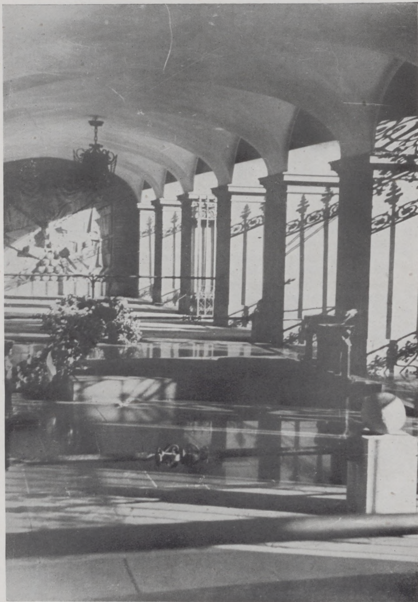
GRAVE OF THE UNKNOWN SOLDIER

recognize the Polish Home Army as an integral part of the Polish Armed Forces.