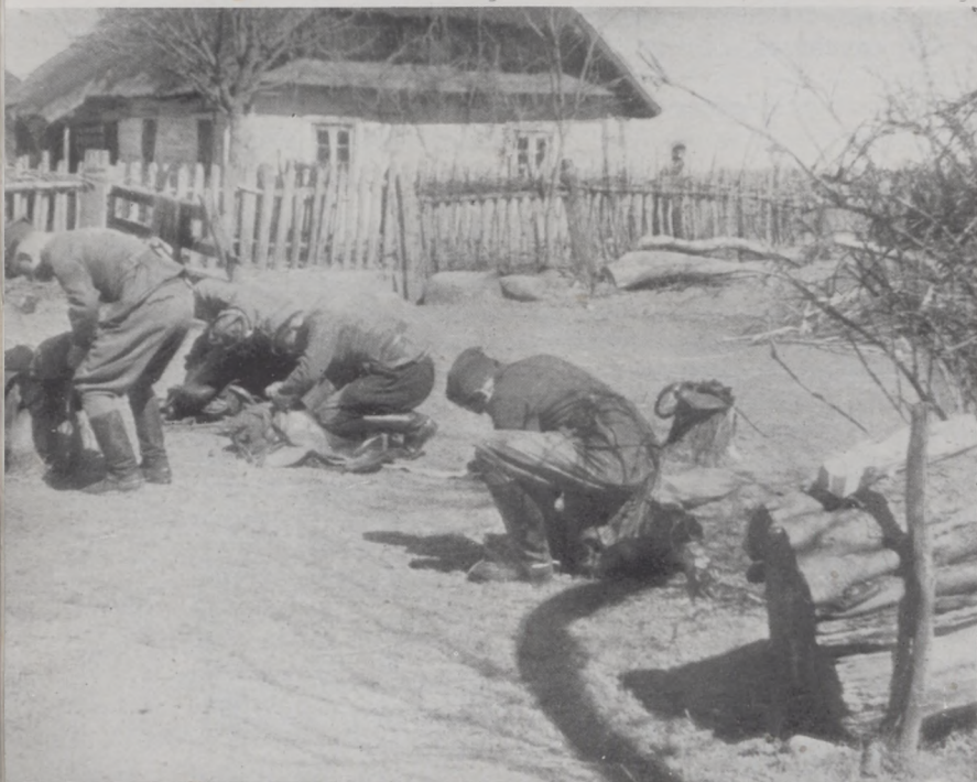
FINAL PREPARATIONS, ON EVE OF ACTION. EXAMINATION OF EQUIPMENT

Bombing from air stopped—but enemy artillery very active especially in STARE MIASTO sector.