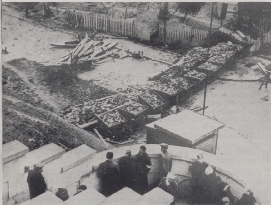
THE BARRICADES IN THE CITY