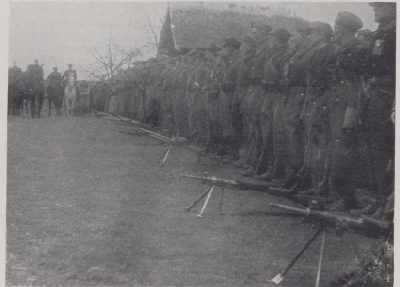
INSPECTION OF A DETACHMENT OF THE HOME ARMY

At the head of the Home Army is its Commandant, directly subordinated to the Commander-in-Chief, whose headquarters are at present in London. Its activities as a whole were directed to two ends: the weakening of the German war-potential on the eastern front, and the preparation of the terrain for future military operations in Poland. In this regard also the Warsaw rising was the result of years of preparatory organization. Further, the Home Army possesses antennae, as it were, with which it reaches the interior of the Reich—organized Polish labourers who were deported for work in Germany. They will prove a hard nut for the Germans to crack.