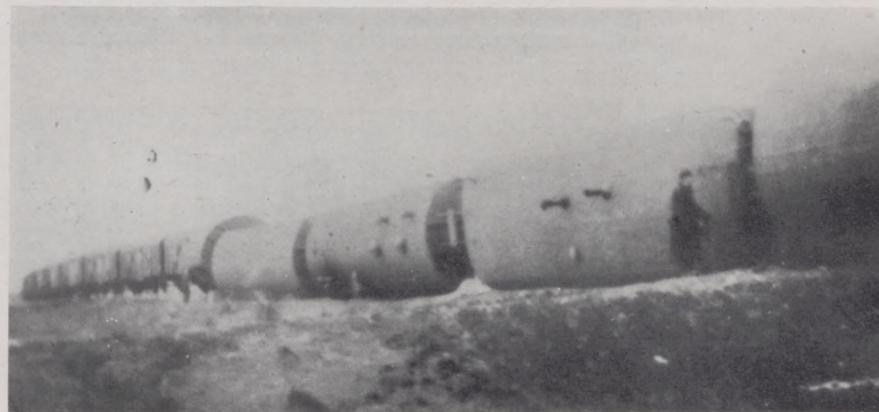
THIS WAS A TROOP TRAIN

In the period preceding the issue of the order Burza , the Home Army had worked without a pause, and thanks to its efforts much Soviet war material had been saved and much Soviet bloodshed spared.