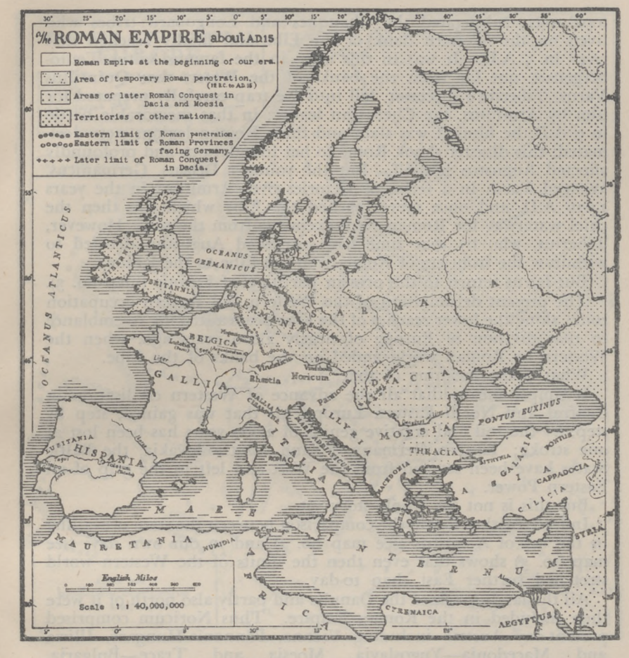
The Boundaries of the Roman Empire in Europe (map 2)

When I studied this map of June 5th, 1945, showing the boundaries of the occupation zones in Germany and Central Europe, it suddenly occurred to me that I had seen this frontier line, bending along the lower reaches of the Elbe. Yes, of course, my memory served me right, though it had to go so far back, to my school-years. Every schoolboy in Europe was and is familiar with it. This dotted