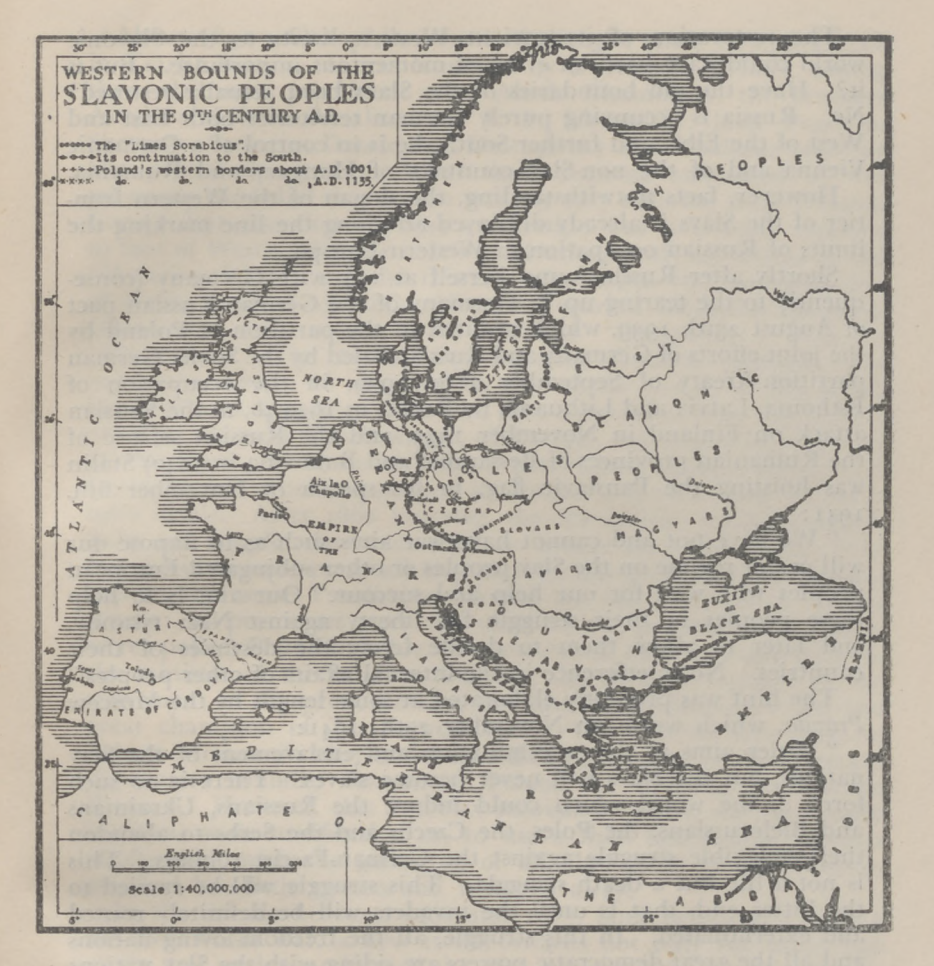
The Western Frontier of the predominantly Slav territories about A.D. 1,000 (map 4)

Molotov treaties of August 23rd, 1939, and September 28th, 1939, enabled her once more to extend beyond the Vistula. The victory of the United Nations, however, and the collapse of Germany made it possible for the Russian forces to reach the old Slav boundaries along the lower Elbe and West of the middle and upper reaches of that river.