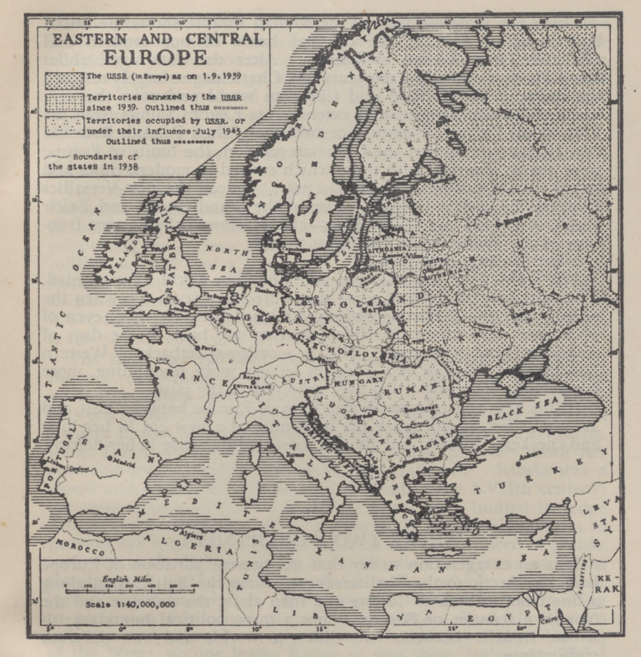
The Partition of Europe in 1945 (map 3)

The history of Europe is the history of the growth, both spiritual and material, of our civilization and the record of her territorial