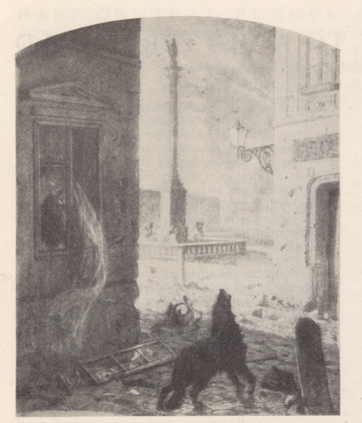
ARTHUR GROTTGER: WARSAW 1861

ART in Poland only became Polish art after Poland had ceased to exist as a separate national entity, following the three partitions at the end of the XVIIIth century. Of course this statement must not be taken too literally, for Poland has every reason to be proud of her high and very ancient artistic culture, to which many churches, castles, and works of art, some dating even from pre-Gothic days, bear eloquent testimony. Among them are many masterpieces that will bear comparison with the finest monuments of other lands and other