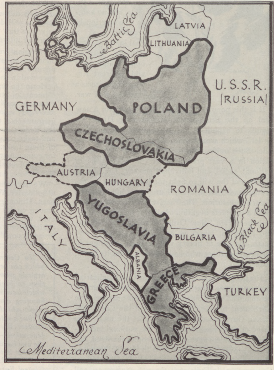
EAST-CENTRAL EUROPE. In the north a Poland and Czechoslovakia Confederation, in the south a similar Confederation of Yugoslavia and Greece. All four countries have expressed their intention of establishing close collaboration after victory. If Austria and Hungary were to join this group — a strong economical and political entity of 100 million people would be established in East-Central Europe.