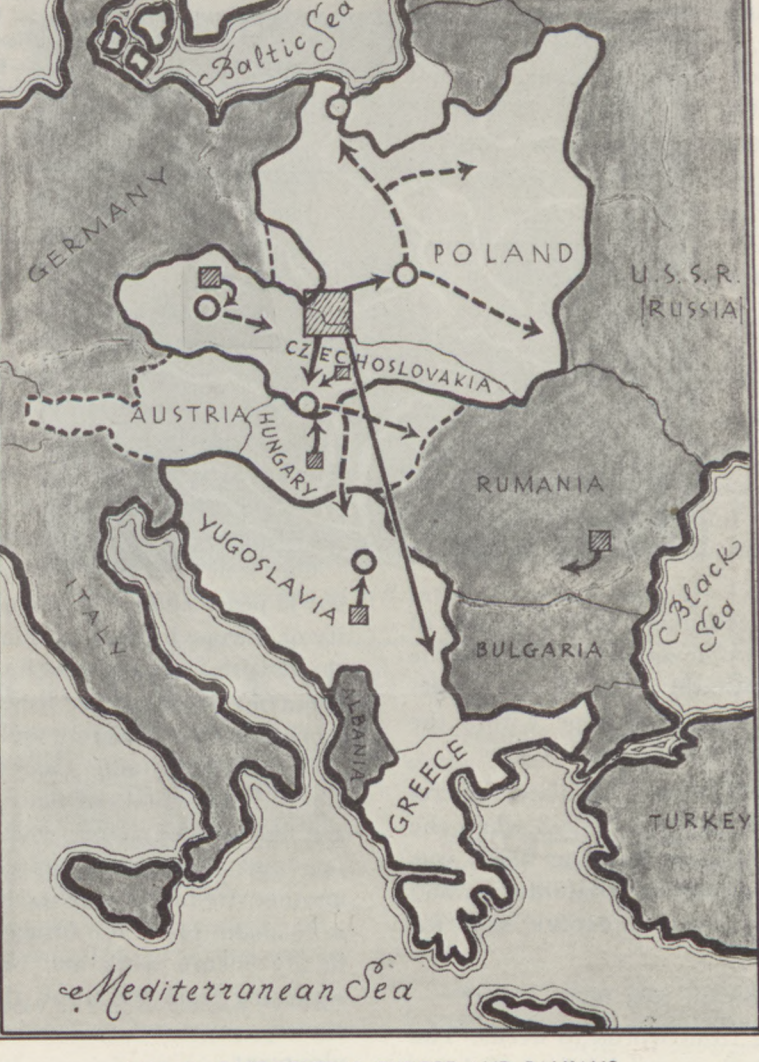
MAP C. EAST-CENTRAL EUROPE AND BALKANS. Proposed economic collaboration after this war.

East-Central Europe's mineral resources, even those which are found in great abundance, and the products manufactured therefrom, are handicapped in