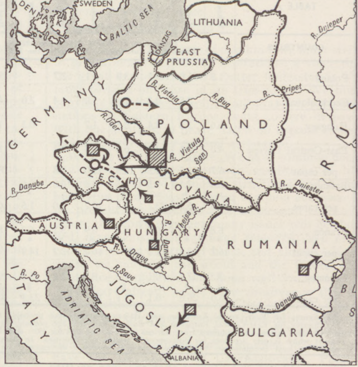
MAP B. EAST-CENTRAL EUROPE BETWEEN 1919 AND 1939 (Maps A, B and C by Mr. P. N. Ommanney.)

A nation or group of nations must either be selfcontained in the sense that an internal exchange of agricultural for manufactured products satisfies the basic requirements of life — or the necessary exchange must be effected by export and import. An