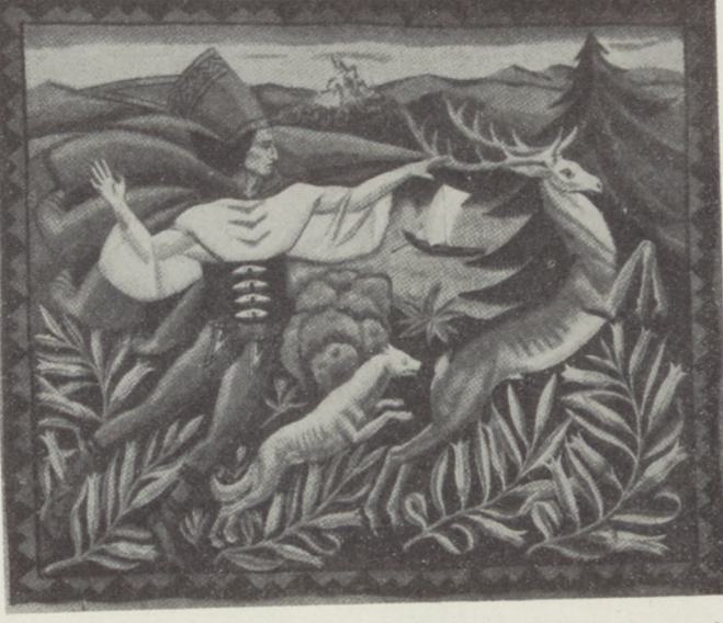
cipal names of the galaxy W. SKOCZYLAS: HUNTING IN THE TATRA (Cartoon for Tapestry) sentially Polish Art.