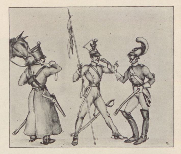
POLISH MOUNTED RIFLEMAN, ULAN AND GENDARME (1830) by Roman Gurtler

Each regiment of cavalry, whether mounted riflemen or lancers, had its regimental colors. Thus, in addition to the navy uniforms of the lancer and the dark green of the mounted riflemen, the regimental colors were worn on the facings of the jackets and the front of the caps. The insignia of the regiment