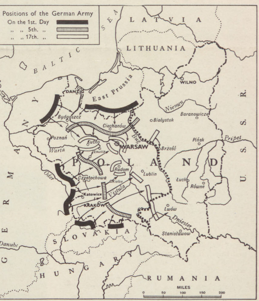
Hitler's rapid victory over Poland in 1939, was due to the large German armies massed in East Prussia, a permanent threat to the heart of Poland and its capital, Warsaw.

Economically within the bounds of modern Germany, East Prussia has always been a liability and not an asset. It was the poorest part of Germany, (Please turn to page 8)