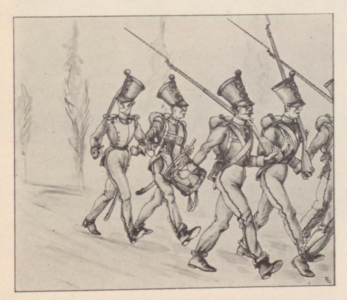
POLISH INFANTRY (1830) by Roman Gurtler

IN VARYING degree, military uniforms are the product of civilian fashions, national traditions, foreign influences, the requirements of war, considerations of comfort and economy, and esthetic appearance. Polish uniforms of a century ago, indeed all uniforms, paid scant attention to the practical. A soldier's uniform had to be handsome, if not