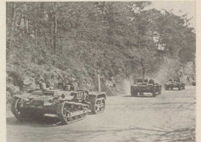
POLISH TANKS IN FRANCE

Though the fall of France was a terrible blow, though Polish troops lost heavily in fighting for her, yet the participation of the Polish army in the French campaign was not in vain. News of the battles fought by Polish armed forces and of the valor of our soldiers spread all over the world, and disproved