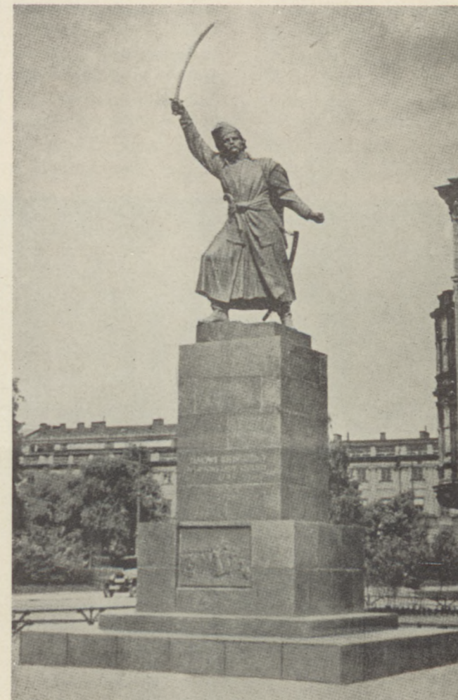
MONUMENT OF JAN KILINSKI IN WARSAW Removed by the Germans

The few remaining theatres in Warsaw are devoted to cabaret, and frequented exclusively by venal wartime elements. They are avoided by all the consciously patriotic and intellectual classes. But a good half of the actor world takes no part in these performances, for reasons of principle, and continues to be employed in offices, trade, cafes, etc. Until recently there was no strict line of demarcation, but now some artists take the line that collaboration in the theatrical world during the occupation is a necessary and non-political form of survival, whereas the second group flatly condemn any form of collaboration with the Germans.