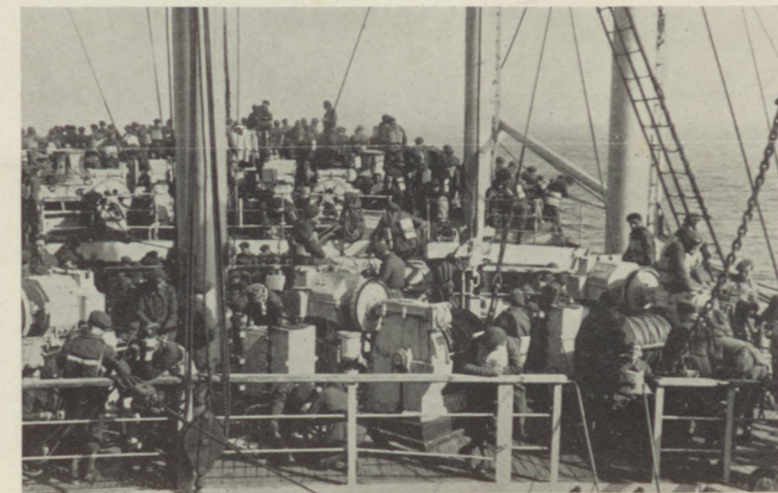
LEAVING FOR GREAT BRITAIN

first pages of the history of Polish forces fighting on foreign soil during this war. This history has been enriched by the prowess of our air force in Britain and of the Carpathian Brigade in Libya. After almost three years of fighting on many fronts and continents, the Polish armed forces, cut off from Poland, are stronger than they were in 1940 and are