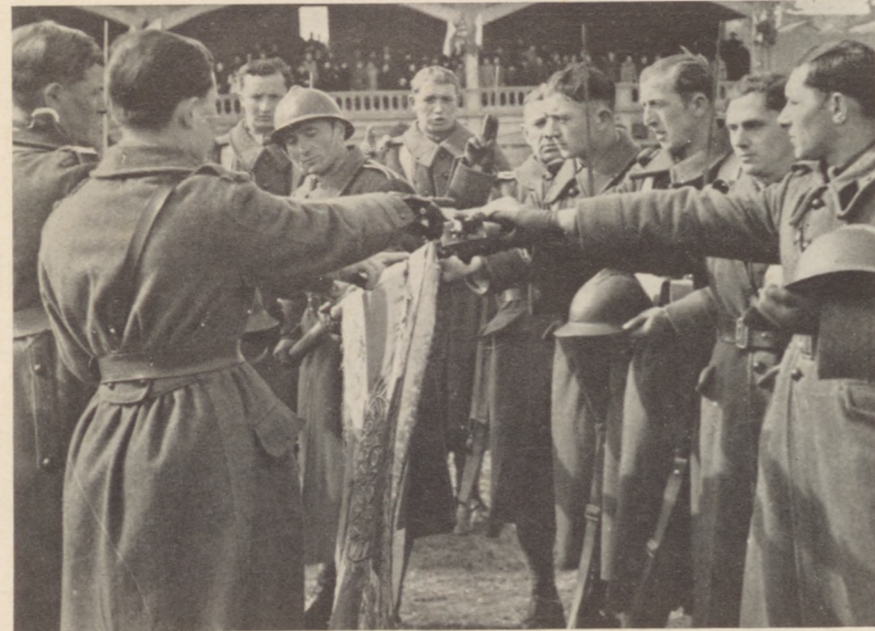
POLISH SOLDIERS' OATH IN FRANCE

WHEN after three years of war we review Poland's battle for freedom, first place must be given to Polish armed forces fighting on foreign soil. And so our thoughts turn to the deeds of a Polish army created in France in 1939, and to the unfortunate campaign in which Polish soldiers not only kept their flag flying, but saved the honor of our country by refusing to capitulate in the chaos of French defeat. Successfully they fought their way through the ever-tightening ring of German aggressors. Here briefly is what the 1st Armored Division did.