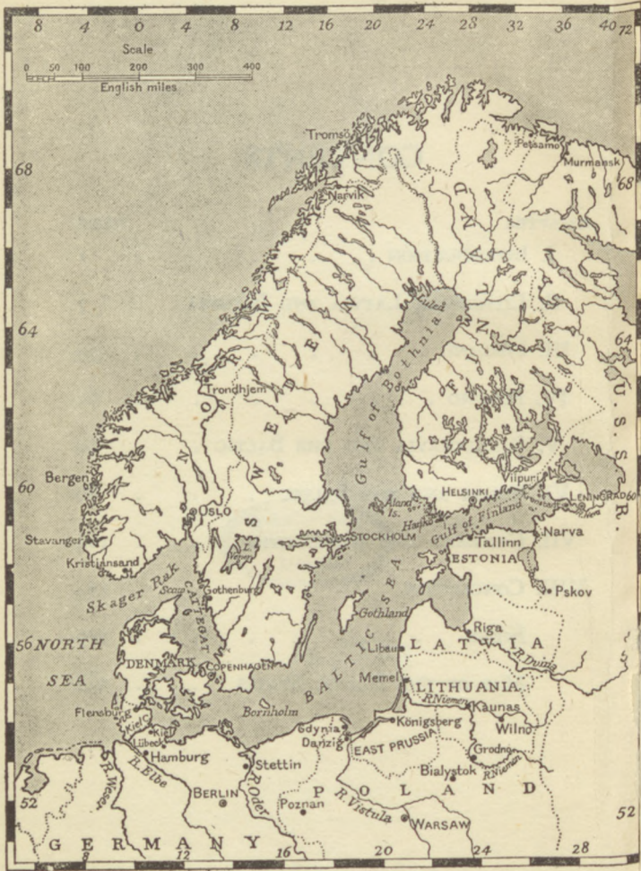
THE BALTIC STATES